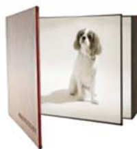
Personalised Photo Albums