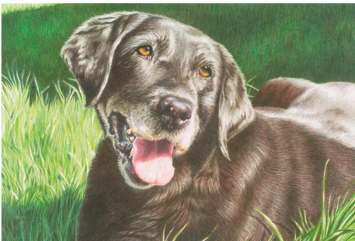
"Resist Me?" (2005), top 25.5 x 34.5 inches, Acrylic on Canvas By Jody Wright

"I paint the animals in the color of their personalities, rather than in the colors that nature has given them. Whether the painting you view is a breed you have lived with or one you have never met... One look into the eyes of the dog reveal a soulful heart of unconditional love.