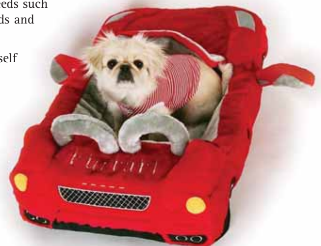
The Furrari Bed from wrapables.com