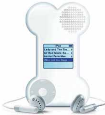
The iPup

They gave us permission to reproduce some of the text of their spoof and a great food shot which would make Gordie curse all the way to the bank.