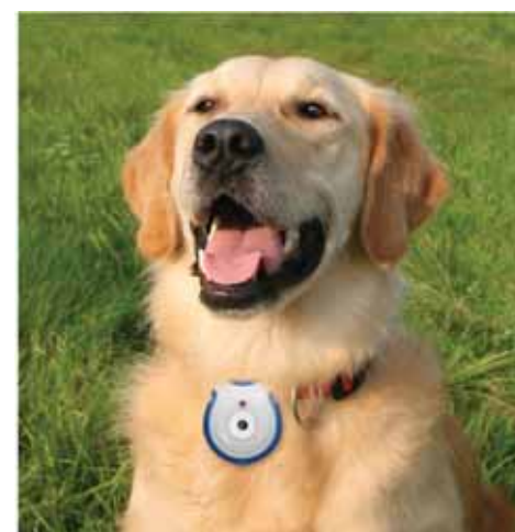
Pets Eye View digital collar camera

The tiny camera on your pet's collar will let you see through the eyes of your cat or dog while they tour the neighbourhood getting up to all kinds of mischief. Or you can see what they do when left at home. It clips onto your pet's collar just like an ID tag, so your pet won't even know its there! The internal memory stores over 40 photos, and the timer can be set to automatically take a shot every 1, 5, or 15 minutes.